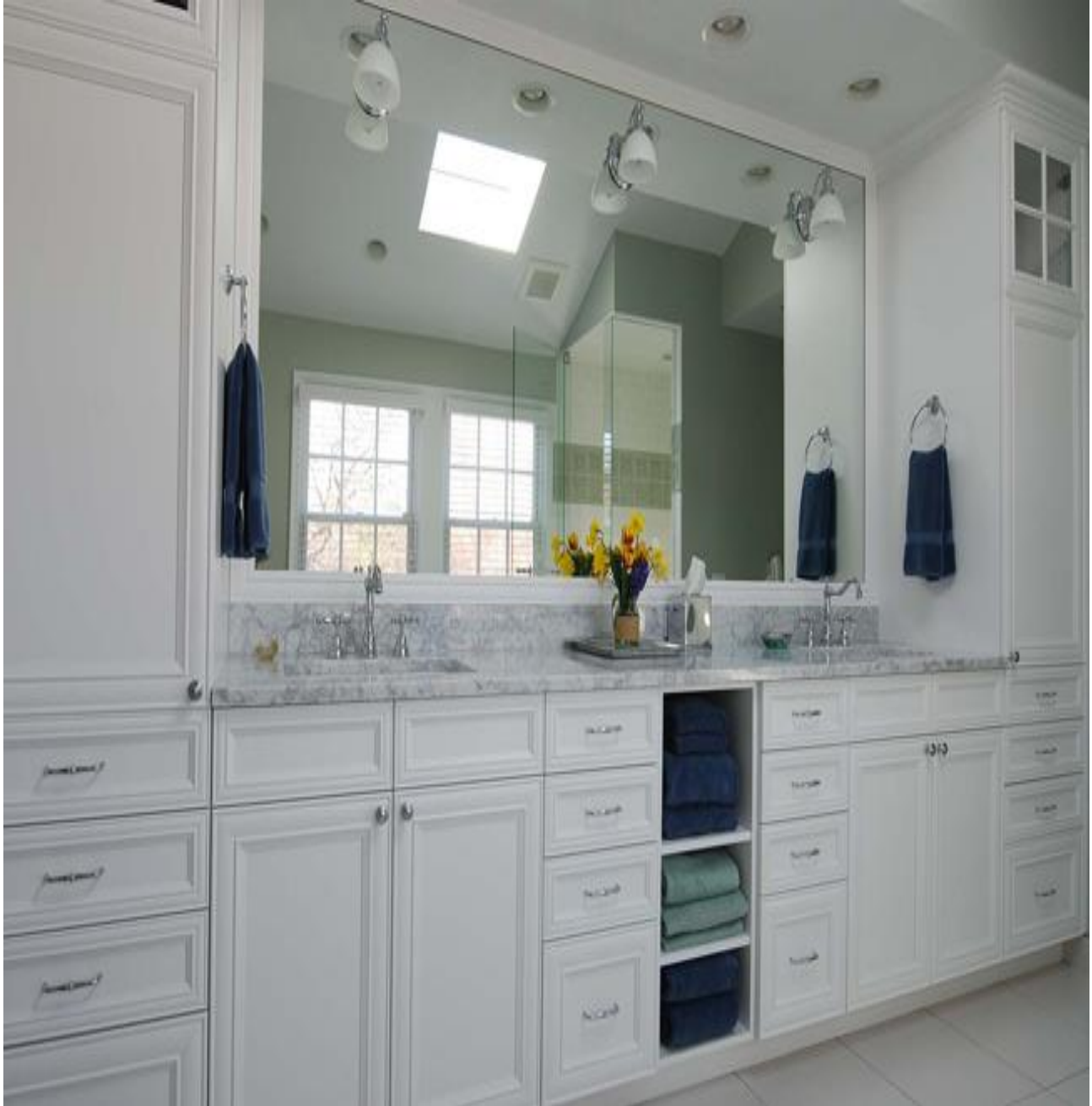
Figure 2: Example of an upscale bathroom remodel

A final deduction that can be drawn from the Cost vs. Value Report is that the average square footage price for a mid-range bathroom remodel is approximately $450/square foot and $500/ square foot for an upscale bathroom remodel.